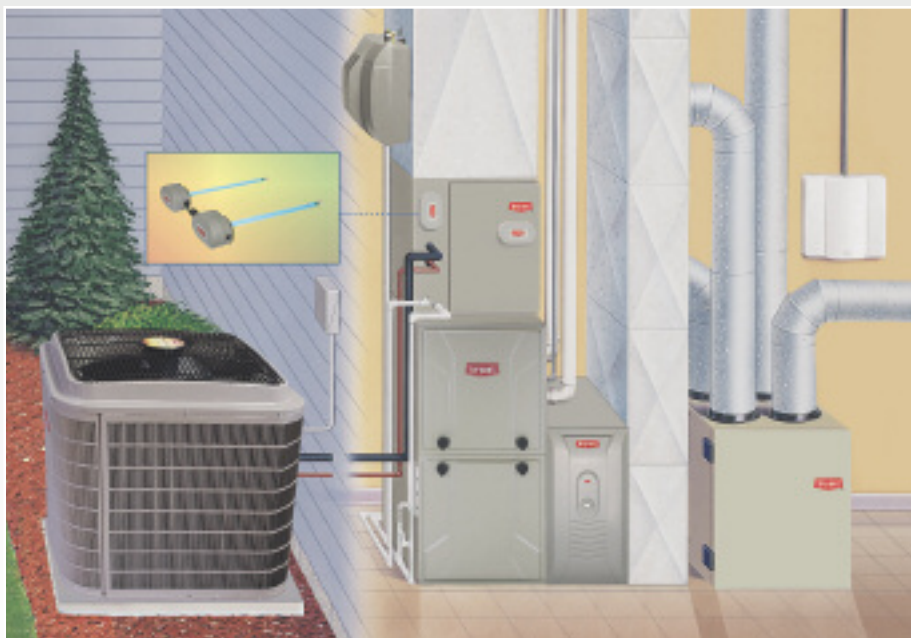
Air Conditioner and Gas Furnace System